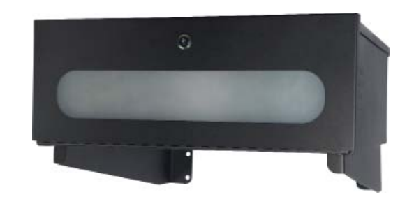
* DVR-WA shown with DVR-LB2